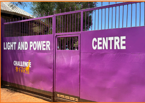
A fresh coat of paint on our front gate!