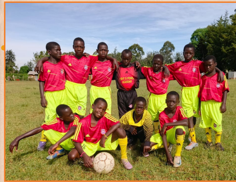
Boys' and girls' volleyball teams!