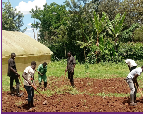
LEARNING AGRICULTURE SKILLS