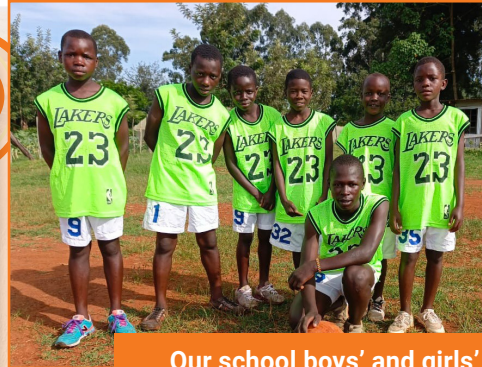
Our school boys' and girls' basketball teams. One of the teams advanced to the zonal basketball competitions!