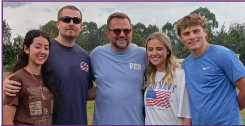
VICTORY FAMILY CHURCH TEAM