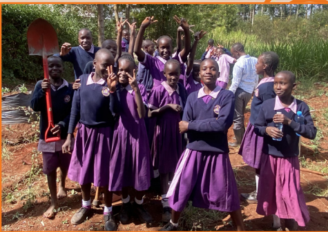
Our proud Agriculture Club!